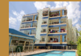
LVS Elite, T C Palya Main Road, K R Puram, Bangalore