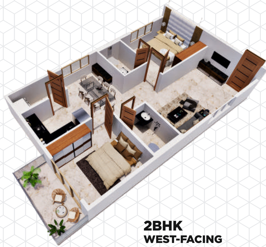
2BHK WEST-FACING 1080 SQ. FT