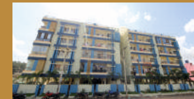
LVS Elegance, T C Palya Main Road, K R Puram, Bangalore