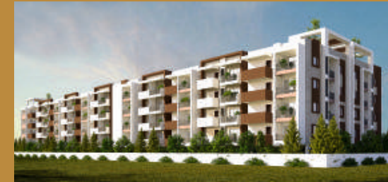
LVS Paradise, Kithaghnur, K R Puram, Bangalore