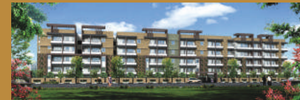
LVS Excellency, T C Palya Main Road, K R Puram, Bangalore