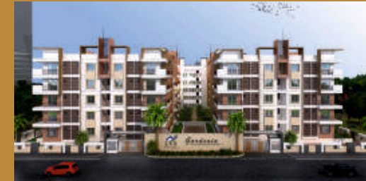
LVS Gardenia (Phase I), Halehalli, Maragondanahalli Main Road, K R Puram, Bangalore