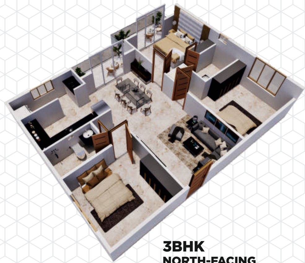
3BHK NORTH-FACING 1445 SQ. FT