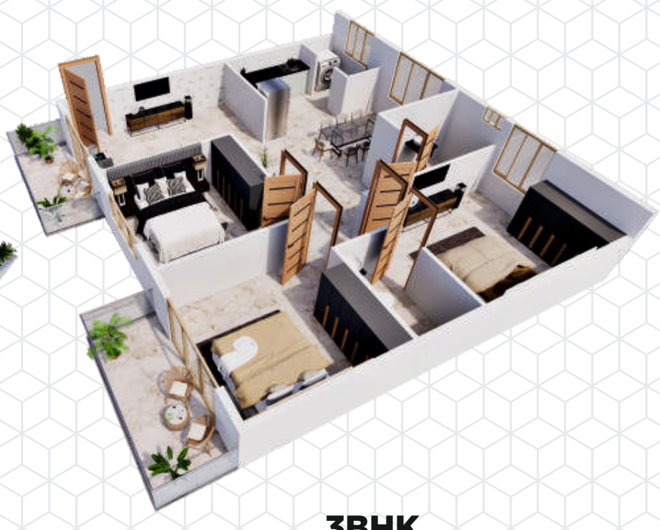
3BHK EAST-FACING 1525 SQ. FT