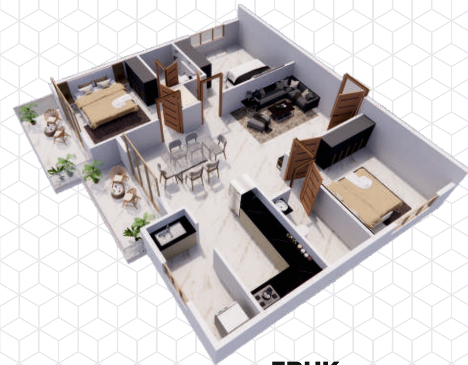
3BHK WEST-FACING 1520 SQ. FT