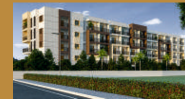
LVS Classic, Kithaganur, K R Puram, Bangalore