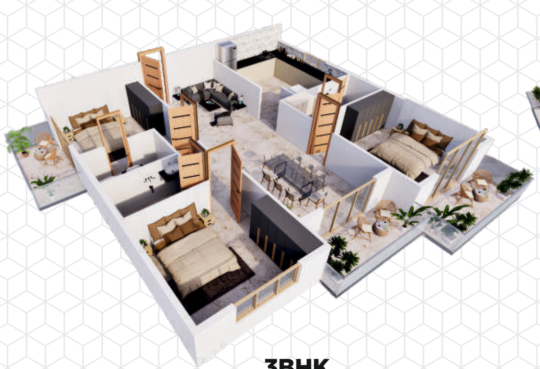
3BHK EAST-FACING 1765 SQ. FT