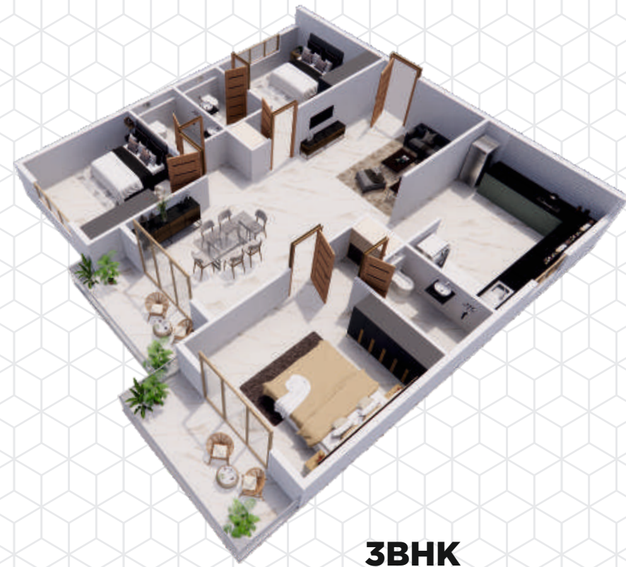
3BHK EAST-FACING 1445 SQ. FT