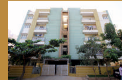
LVS Lavender, Behind Manyata Tech Park, Tannisandra, Bangalore