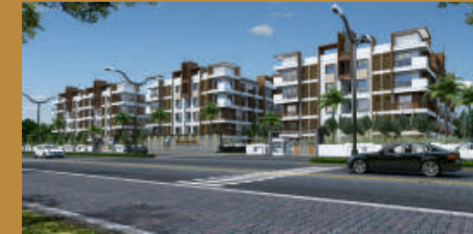
LVS Gardenia (Phase 2), Halehalli, Maragondanahalli Main Road, K R Puram, Bangalore