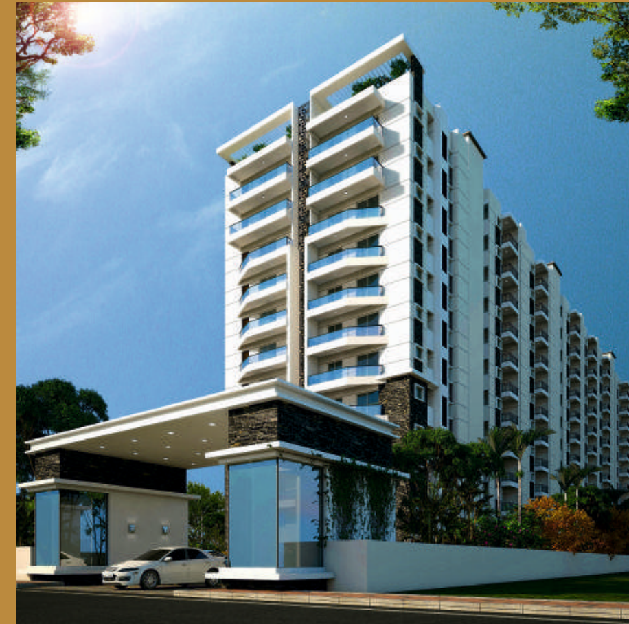
LVS Heights Halehalli, Maragondanahalli Main Road, K R Puram, Bangalore